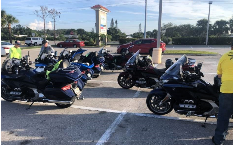
6 bikes for our ride so far and all 6th generation