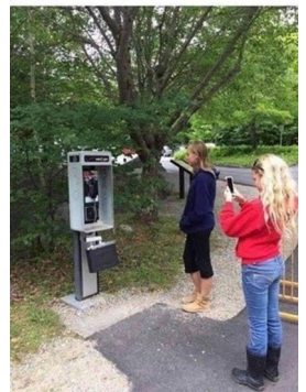
Kids exploring ancient ruins

Yesterday, I was cooking dinner, and my son came up to me and said, "One day I will work and help you with the bills, the groceries, and the house expenses." My eyes started to tear up. My baby will be 32 next month.